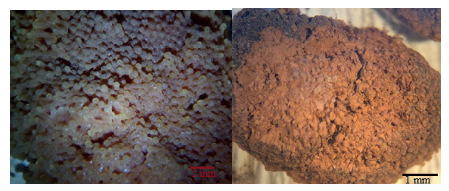
Figure 1. Pseudoaethalium structure of Tubifera ferruginosa (Batsch) J.F. Gmel

Researches and Evaluations in the Field of Biology • 25